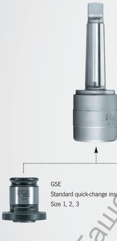
GSE Standard quick-change insert Size 1, 2, 3