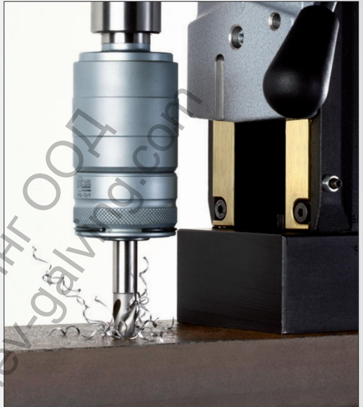
Drilling, countersinking and thread cutting with a magnetic core drilling machine from BDS. Quickly, easily and with high precision.

For magnetic core drilling machines of the ProfiPLUS class.